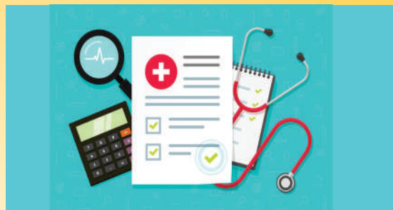
Annual health check up