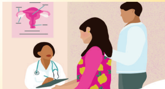
Visit for infertility treatment