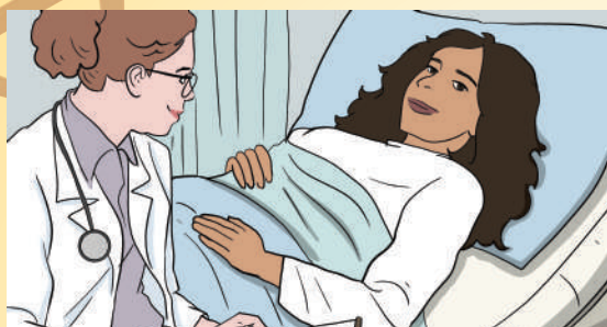
Postpartum check up