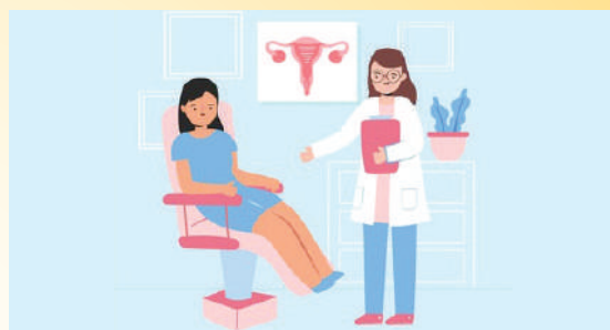
A visit for a pregnancy test (esp if test negative)